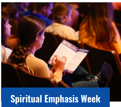
Spiritual Emphasis Week

LCA is blessed to employ an Athletics Chaplain and Christian coaches who emphasize the importance of performing for an "Audience of One." Each of our sports programs include prayer and devotion as part of their weekly activities. We believe we must be grateful for and honor the One who provides the talents we have been given.