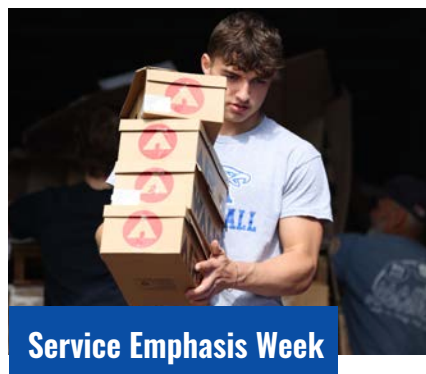
Service Emphasis Week

Each fall, the high school hosts a "Spiritual Emphasis Week," where outside speakers challenge our students to grow closer to Christ. Sessions are filled with wisdom, encouragement and worship.