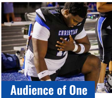
Audience of One

The high school experience includes many special events and celebrations to honor and thank our Lord. Those programs include Senior Convocation, Senior Retreat, Freshman Retreat, Baccalaureate, and Night of Worship.