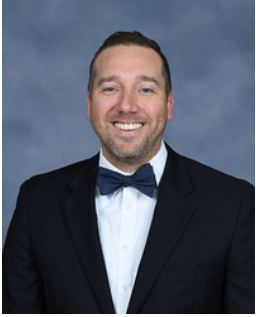
Coleman Marshall Junior High Principal